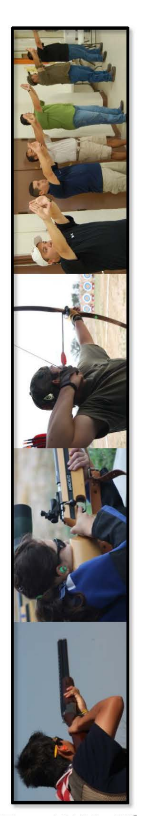
Texas A&M AgriLife Extension Service

4-H Youth Development Program 2401 E. Highway 83 Weslaco, Texas 78596 Phone: (956)968-5581 Fax: (956)969-5639 http://d124-h.tamu.edu